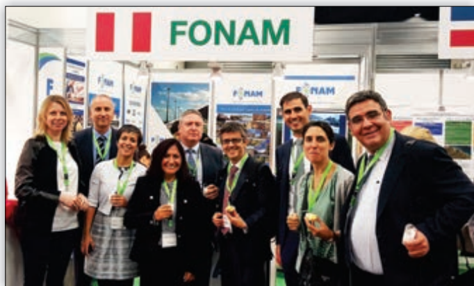
Participation of FONAM in the Carbon Expo 2016, Cologne – Germany